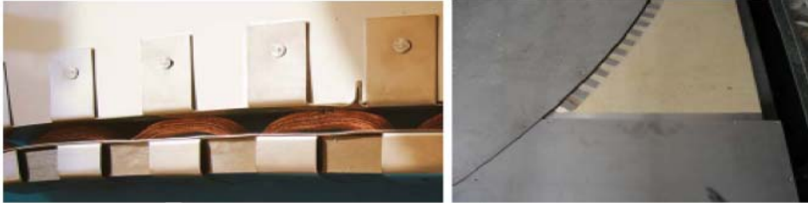
Figure: Contact System Between the Turntables and to the Ground Plane

There is a long-lasting maintenance-free contact systems included; Material: Hollow Core Copper Beryllium Tubing