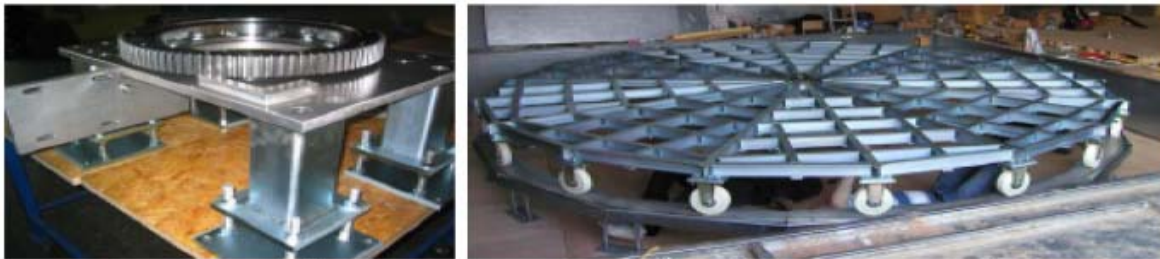
Figure: Level System of Turntable for Height Adjustment

The covering is made of stainless steel, the gap between the turntable and the ground plane less than 5 mm. The radial run out is within a tolerance of +/- 3 mm. The height differences are within a range of 10 mm or better.