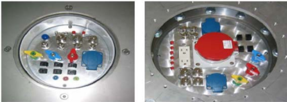
Figure: Power Supply in the Centre for EUT

it is possible to integrate various types of connectors for the power supply of the EUT.